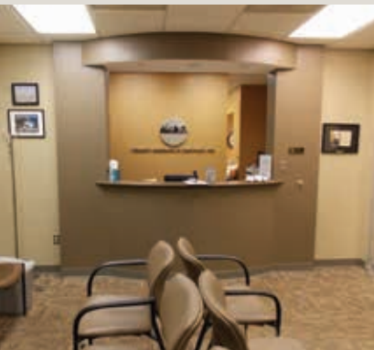
Top: Two Prestige Place—Dayton, OH Middle: Barclay Building—Dayton, OH Bottom: Podiatry Associates of Cincinnati—Cincinnati, OH