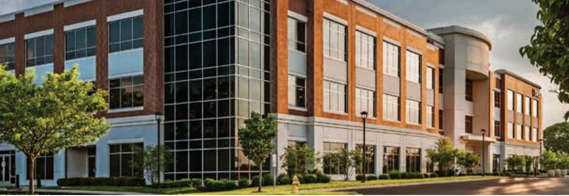
Mission Point at WPAFB—Beavercreek, OH